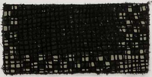
N - BEIG