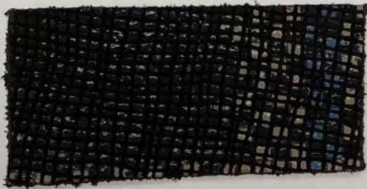
N - OCRE